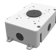
Rectangular Junction Box XX-BLT-CBB